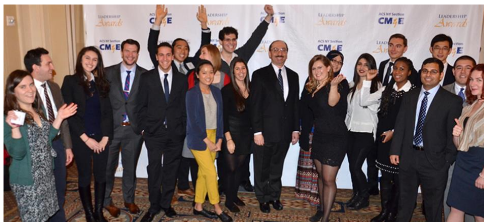
Since 2011 CME has helped over 300 STEM students develop networking and leadership skills.

Provided forum for first speaking engagements of chemistry industry CEOs in NYC