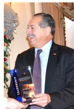
Andrew Liveris, 2014 Lifetime Achievement.