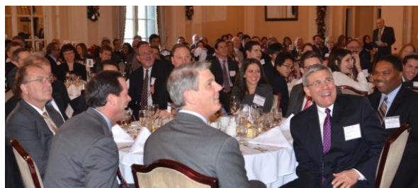
Sonneborn and Peroxichem executives celebrating the Diamond Jubilee of CME Group of ACS New York.